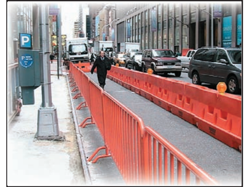
Temporary Pedestrian Walkway