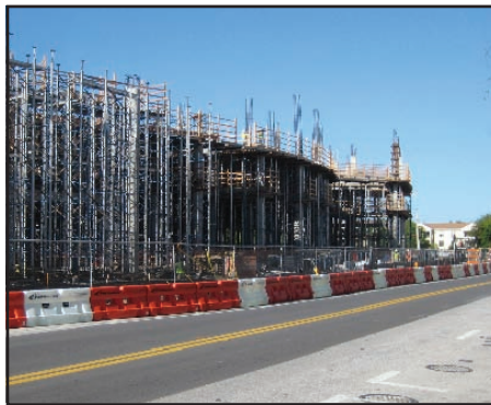
Longitudinal Channelizing Barricade